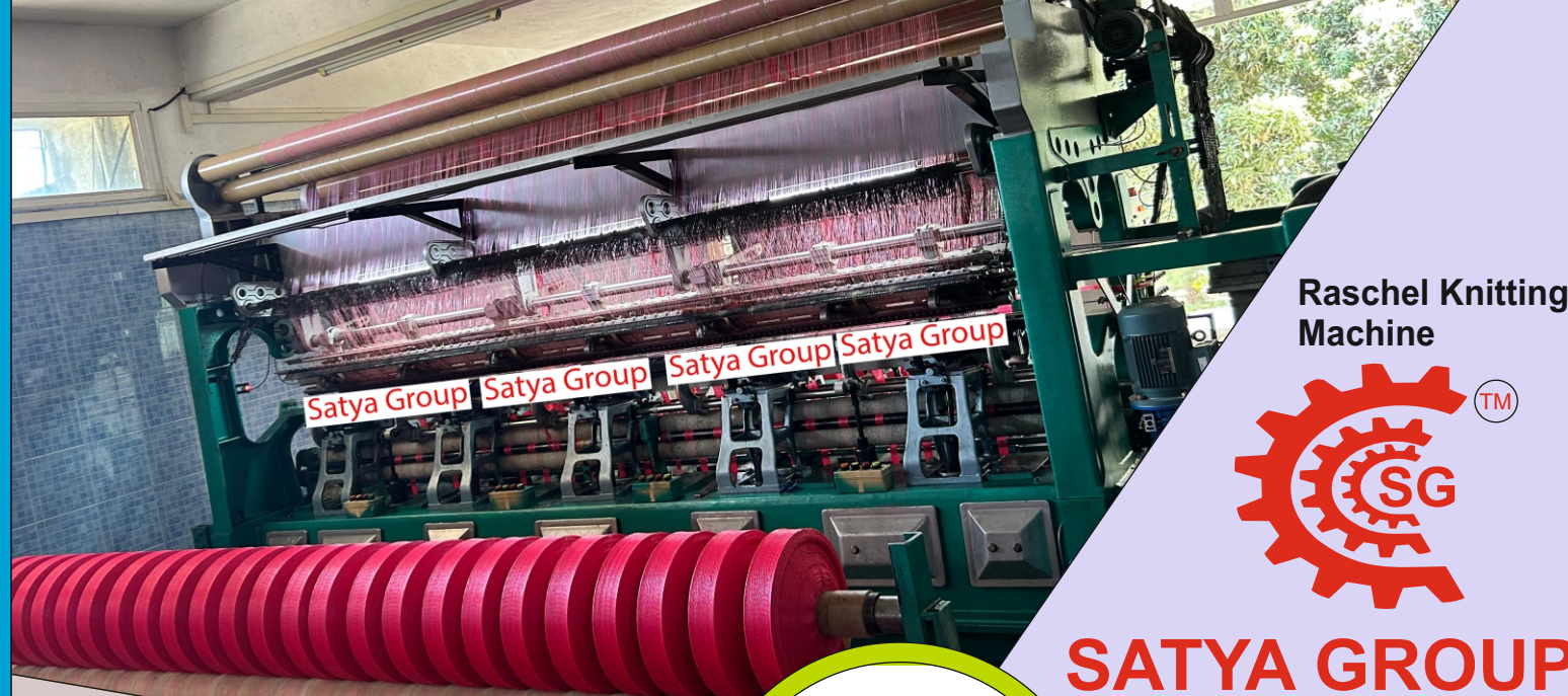
Raschel Knitting Machine